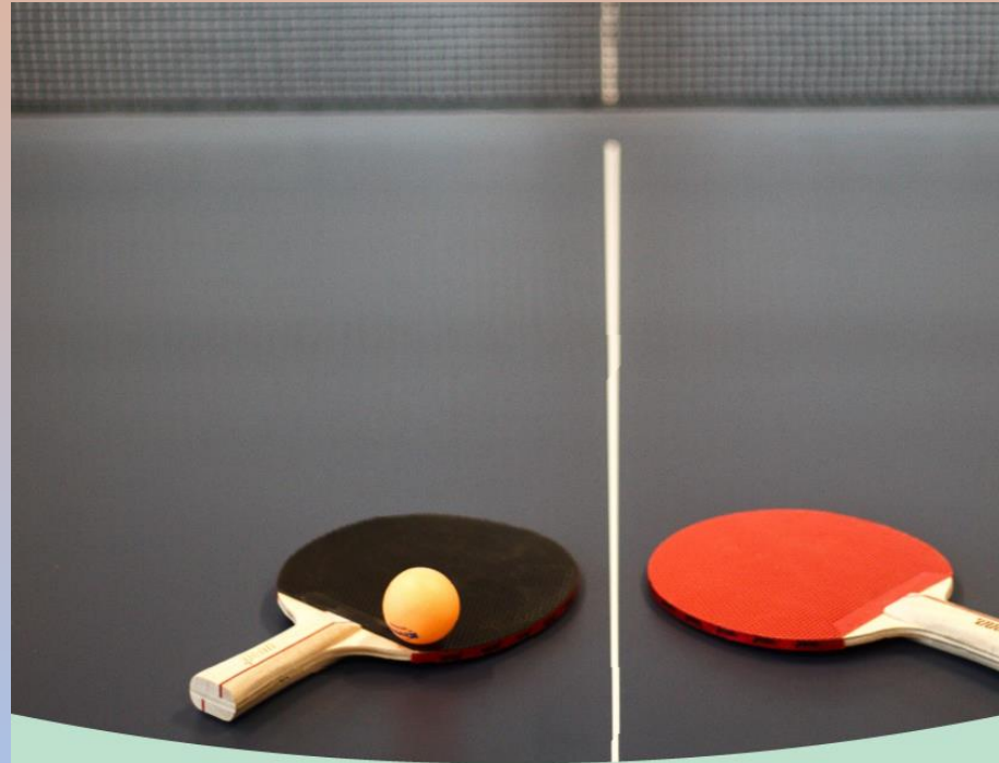
Table tennis 乒乓球